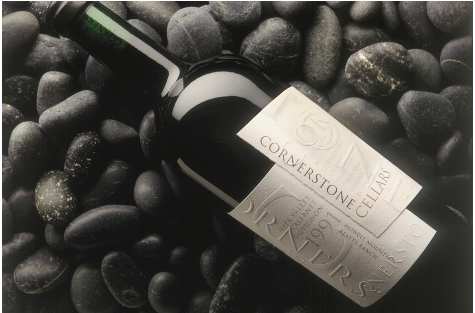
Michael Osborne Design 7-14