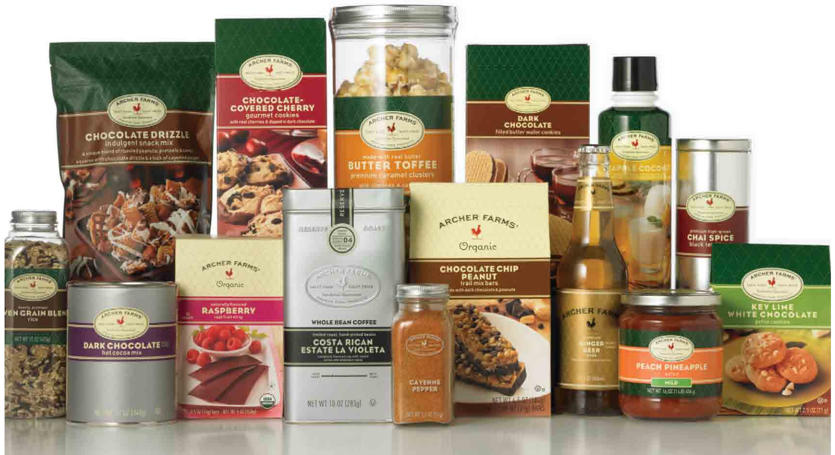
Michael Osborne Design 6-14