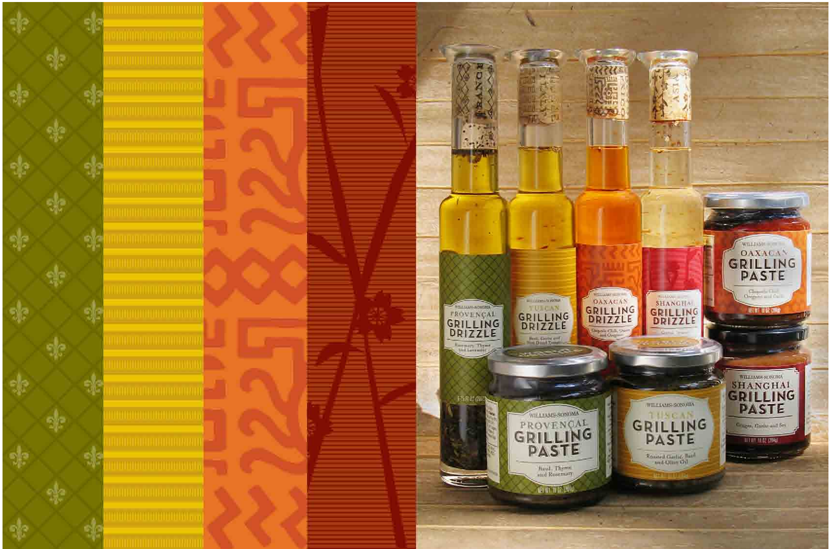
Michael Osborne Design 2-14