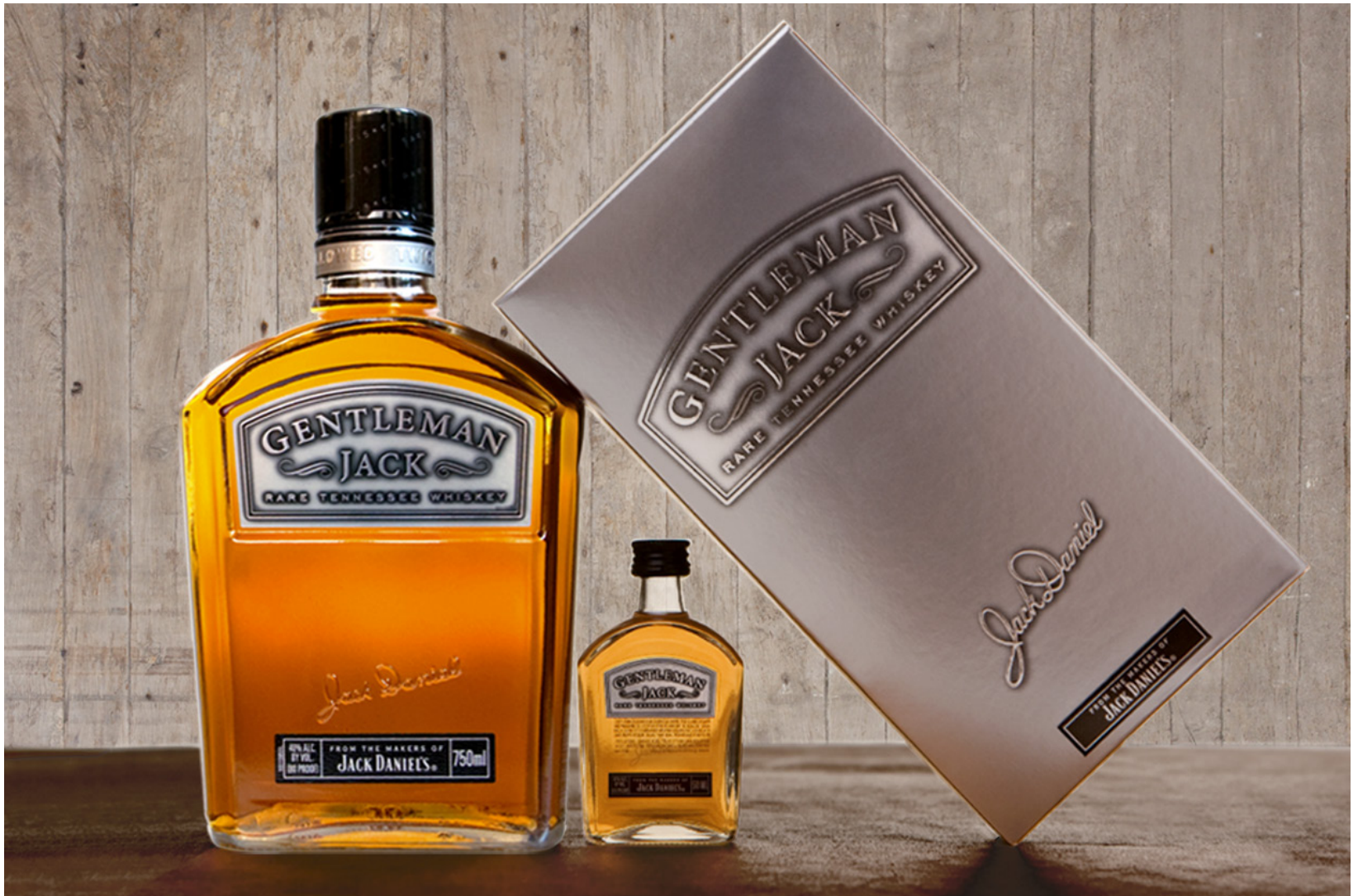
Michael Osborne Design 9-14