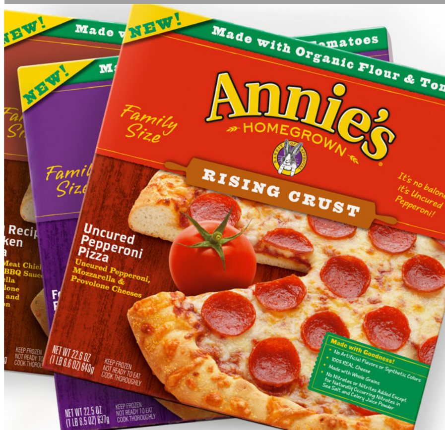
Annie's Homegrown Frozen Pizza Package Design