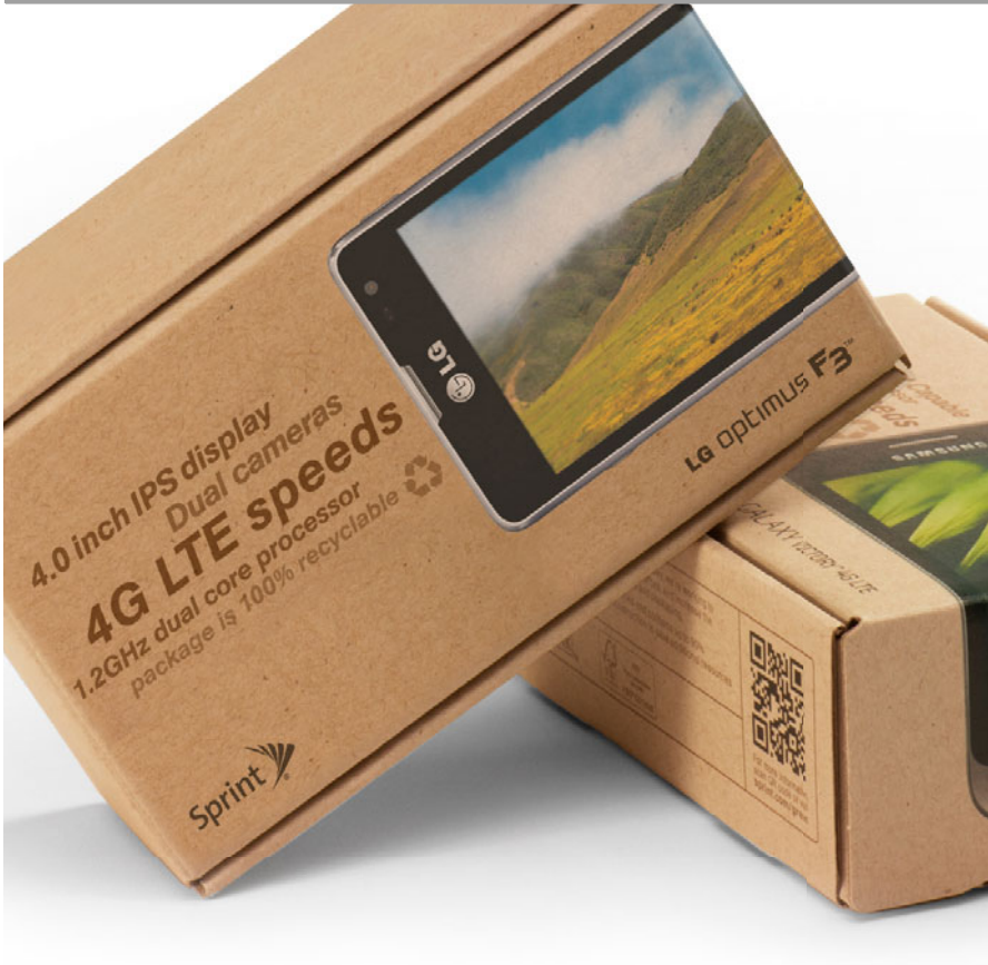
Sprint Device Packaging Package Design