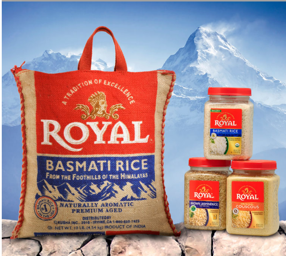
Kusha Royal Basmati Rice Branding & Package Redesign